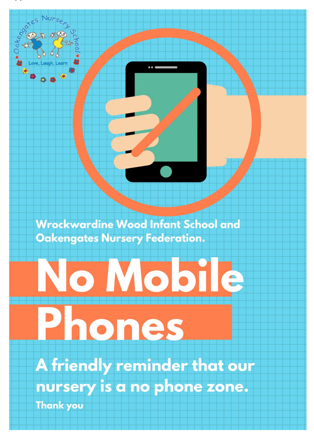
Appendix 2b: ON No Phone Zone Poster